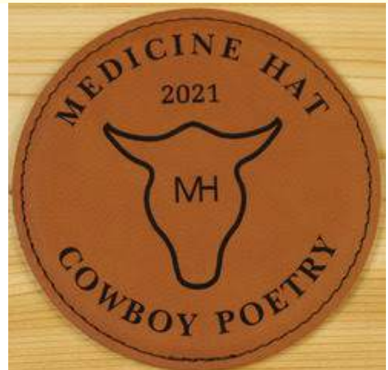
2021 Membership Gift